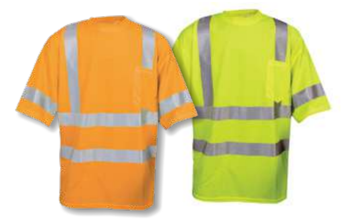
COR-BRITE® Short Sleeve Shirts