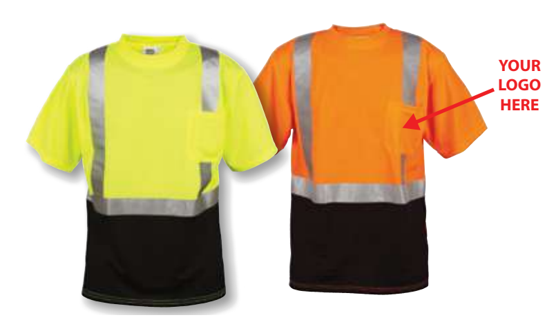
COR-BRITE® Short Sleeve Shirt