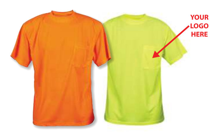
COR-BRITE® Short Sleeve Shirt