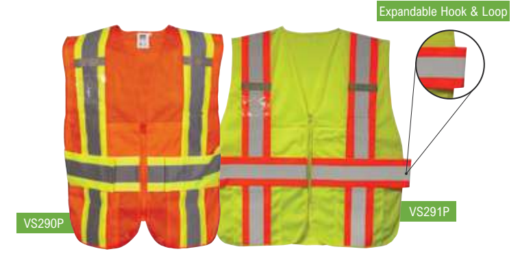
COR-BRITE® Expandable Vests