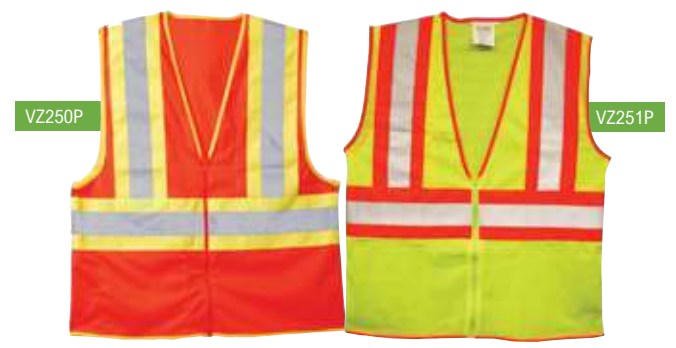
COR-BRITE® Mesh Vests