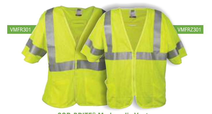
COR-BRITE® Modacrylic Vests