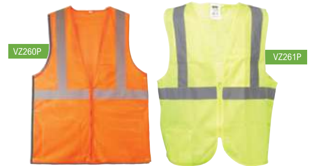
COR-BRITE® Mesh Vests