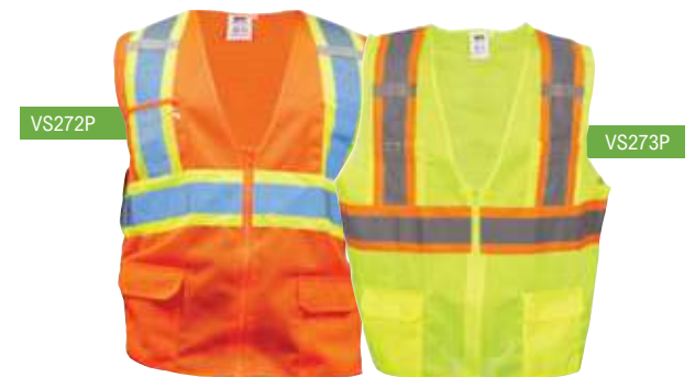
COR-BRITE® Surveyor Vests