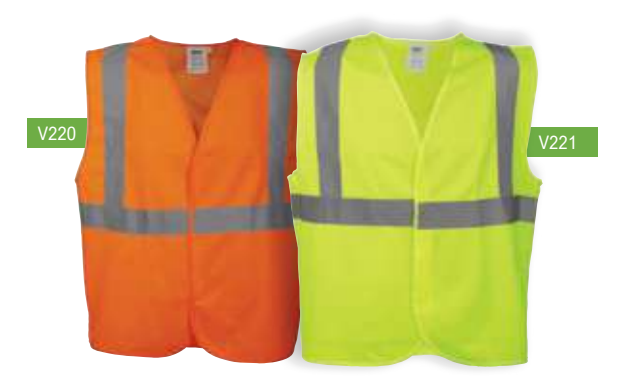
COR-BRITE® Mesh Vests