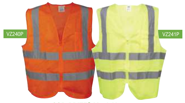
COR-BRITE® Mesh Vests