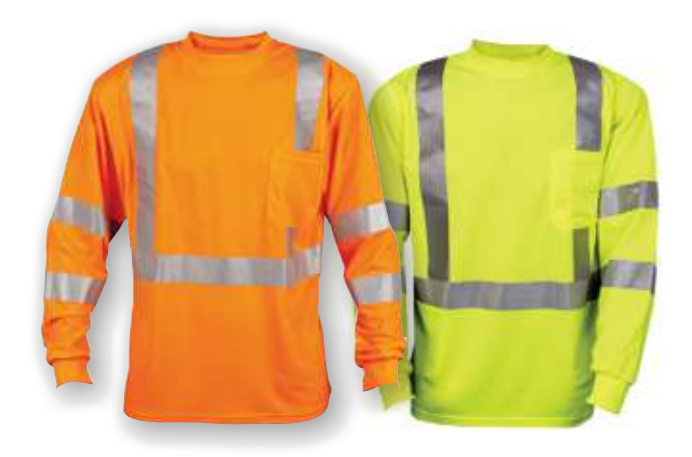
COR-BRITE® Long Sleeve Shirts