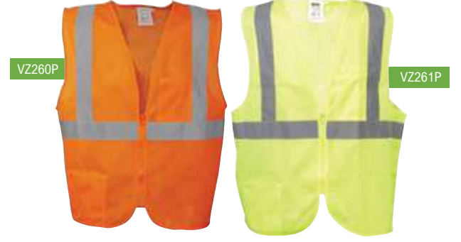
COR-BRITE® Mesh Vests