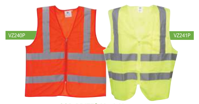
COR-BRITE® Mesh Vests