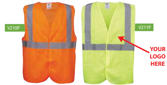
COR-BRITE® Mesh Vests