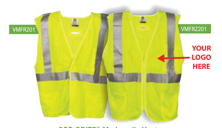
COR-BRITE® Modacrylic Vests