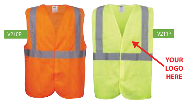
COR-BRITE® Mesh Vests