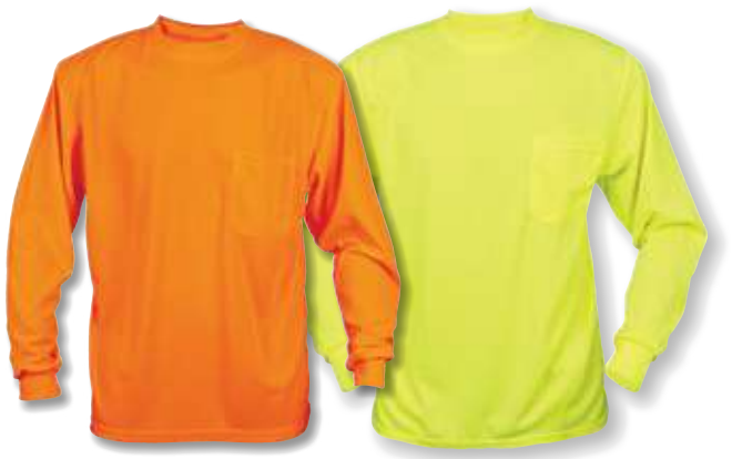
COR-BRITE® Long Sleeve Shirts