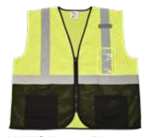
COR-BRITE® Vest | #V571