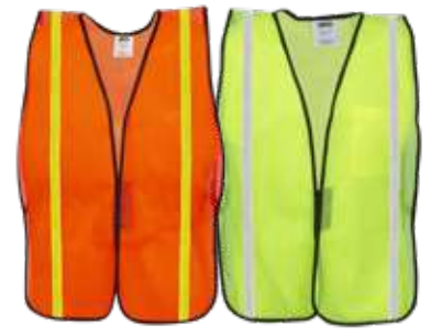
Non-Rated Safety Vest