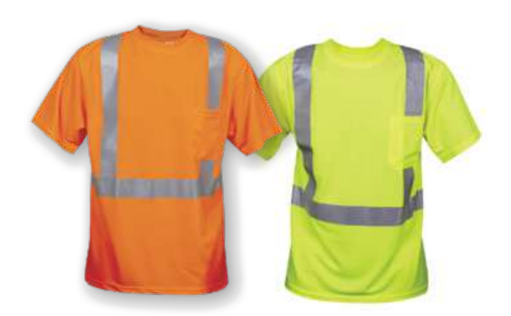
COR-BRITE® Short Sleeve Shirts