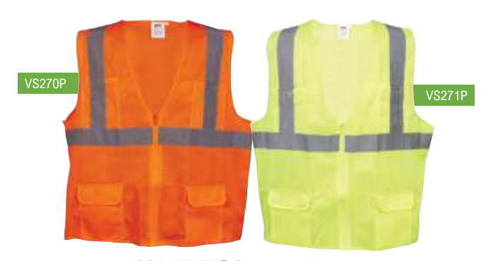
COR-BRITE® Surveyor Vests