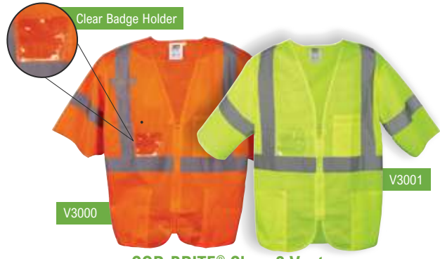
COR-BRITE® Class 3 Vests