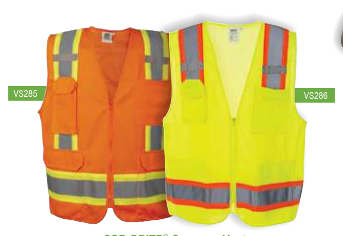
COR-BRITE® Surveyor Vests