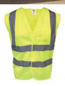
COR-BRITE® Mesh Vest | #V241P

Cordova Safety Products offers a wide variety of high visibility apparel including Class 2, Class 3, and Non-Rated Safety Vests. Our vests are available with a multitude of options to address all hi-vis applications.