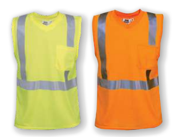
COR-BRITE® Sleeveless Shirts | #V421