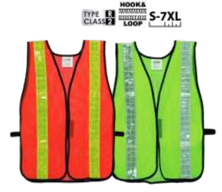
Non-Rated Safety Vest