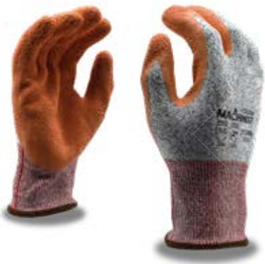
MACHINIST™ Crinkle Latex | #3734NR