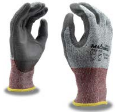
MACHINIST™ Polyurethane | #3734PU*