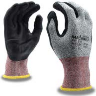
MACHINIST™ Nitrile Foam | #3734