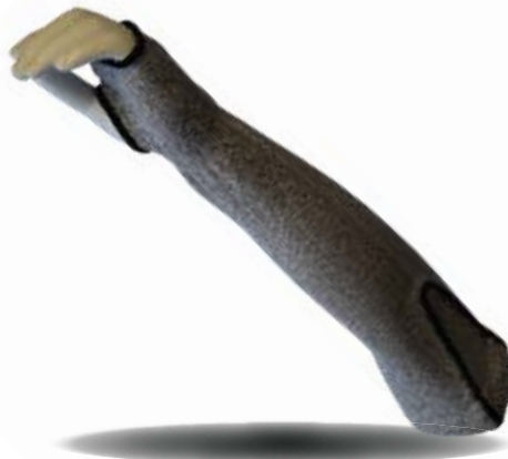
MACHINIST™ High Performance Sleeve | #3748T