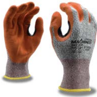
MACHINIST™ Sandy Nitrile | #3734SN